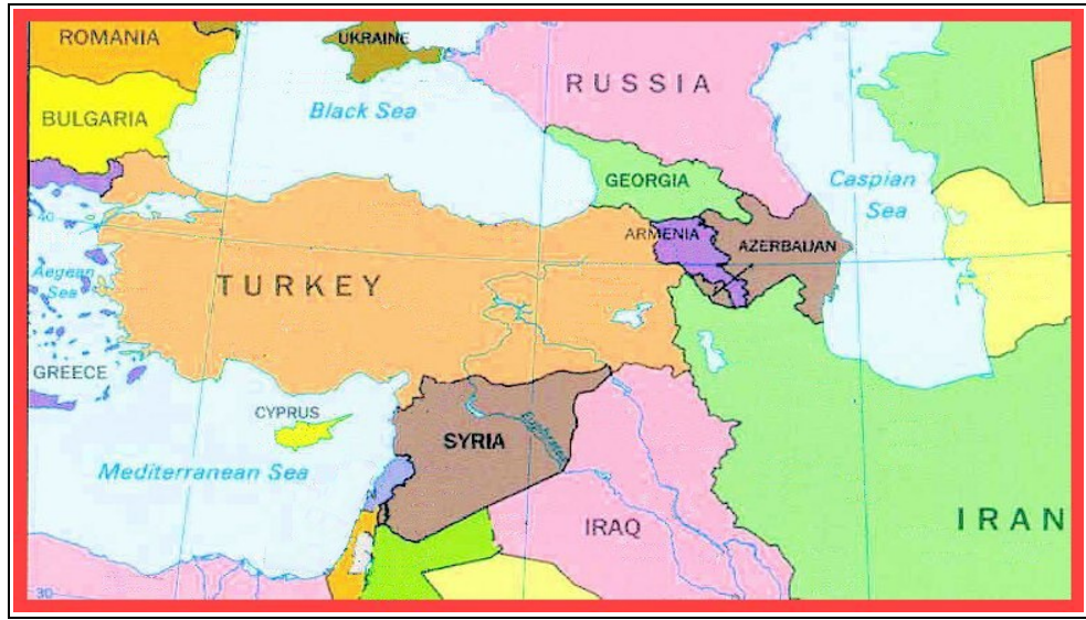
Even the current borders of Turkey, Russia, & Iran show that as Russia invaded Iran (Persia) it was North & East of Turkey.

But what of Persia on the east? Did disturbances come from the east as well? Yes they did. At the same time as it was fighting Turkey, Russia was also fighting Persia in the Russo-Persian wars, the last of which